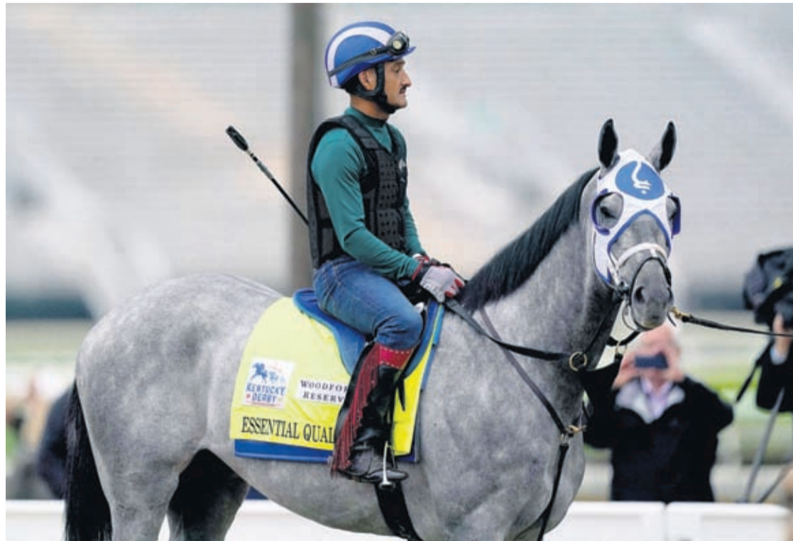
Kentucky Derby entrant Essential Quality waits to work out at Churchill Downs in Louisville, Ky., in this Thursday, April 29, 2021, file photo.